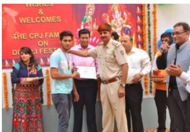
Winners appreciated by Dignitaries at Diwali Carnival on 28 th Oct 2016

Diwali Carnival which was celebrated on 28th Oct, 2016 in the college premises added another beauty to the festive celebrations organized by CPJ College round the year. Entire college campus was decorated and enlightened for the purpose. The event organized in the college compound was inaugurated with religious offering Ganesh Vandna and Lamp Lighting Ceremony.