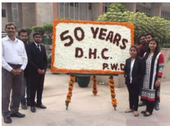
Student's during Delhi High Court Visit on 2nd Nov 2016