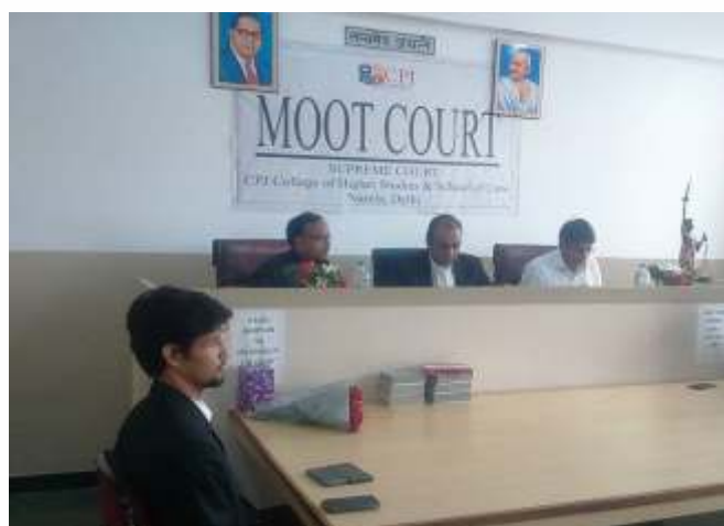
3 rd Intra College Moot Court Competition 2016 on 31 st Aug, 2016

Moot Court activity is an integral part of the curriculum of Law course as it helps the students to understand practical and procedural aspects of Courts. Our College organized its 3 rd Intra College Moot Court Competition on 31 st August, 2016 on theme based on "Constitutional Law".