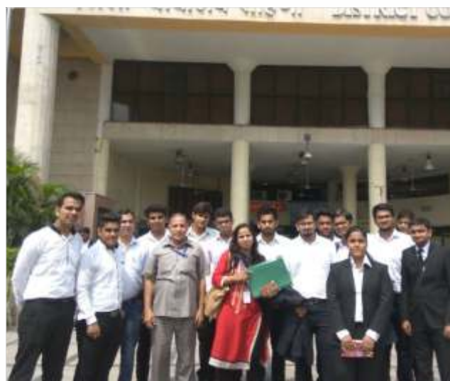
Students at Rohini Court on 15 th Sep 2016