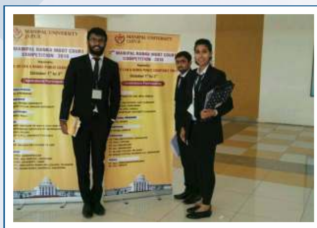
Students Presenting in Manipal Ranka Moot Court Competition on 1st to 3rd Oct