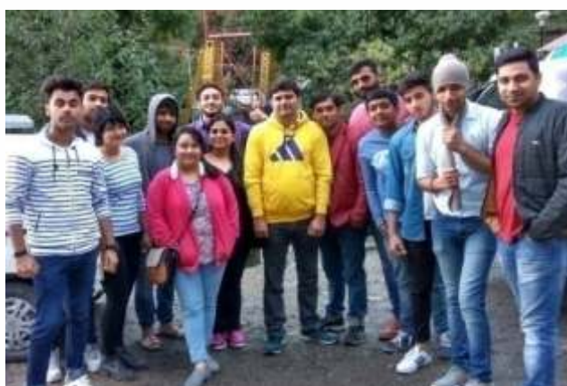
Students enjoying in Dalhousie Trip on 16-20 th Oct 2016

National Flag was flurred by senior functionaries of the college followed by spirited speech by Principal, School of Law as a remembrance to the great leaders who contributed their might and life for the nation for the freedom of India. Patriotic songs and music was melodiously played followed by distribution of sweets. Overall it was an occasion of high spirits exhibited by all.