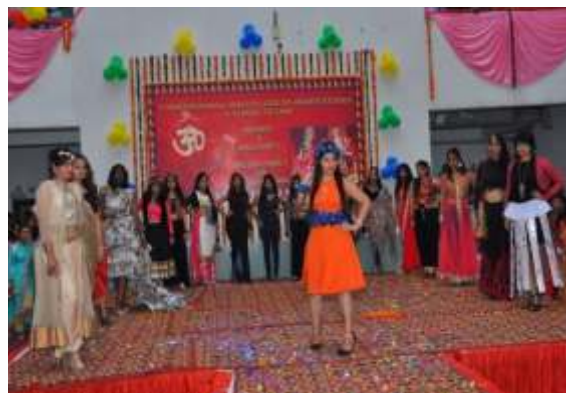
Students participating in Fashion Show at Diwali Carnival on 28 th Oct 2016

competitions besides other cultural events of Let's Rock, Rapping, Jazz up the floor, Quali, couture and Notanki Mehal were held which were well enjoyed by all. At the end winners of all these events and competitions were appreciated and awarded for the