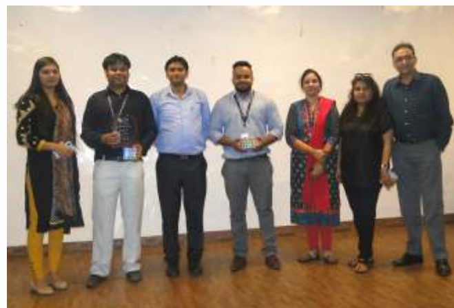
Dignitaries during Placement Drive on 25 th October, 2016

Last round was a written aptitude test which tested students on the basis of reasoning, English Grammer and general knowledge. In the entire exercise Thirty Three (33) students were selected. Concentrix welcomed all other shorlisted candidates for its forth coming training and development. Average Salary offered by the Company is 2.4 Lac Per Annum.