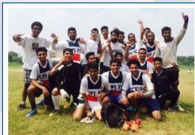
Students at Football Tournament at GGSIPU on 18 th Sep, 2016

GGSIPU organized Inter College Football Tournament which was played in the month of 18th September 2016. We played first match with AIMT College and won the match by 5-3 and entered in the 2nd round. We won our second round match against JIMS, Noida by 1-0. We lost our third round match with ALS College by 0-3.